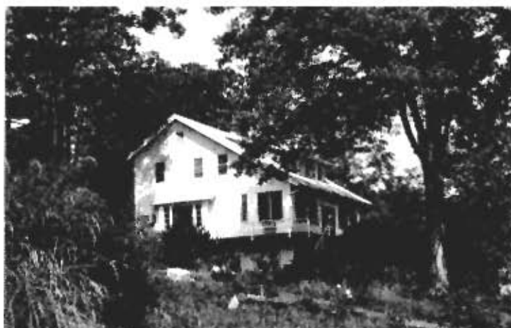
The family home in Nyack, New York.